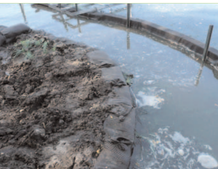
Building the wall

During the construction of each course, live plants were installed between the bags. The wall below the waterline was vegetated with emergent zone native plants. As the wall progressed upwards out of the water, they changed to mesic plants.