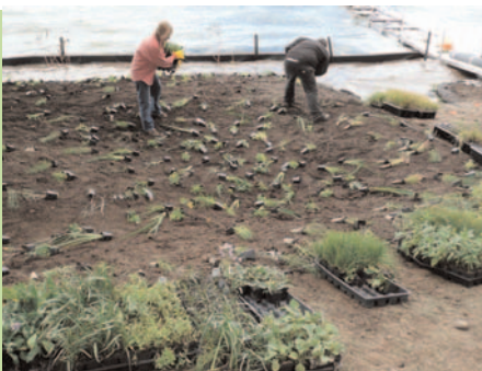
Planting the rainwater garden