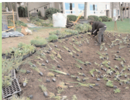
Planting the rainwater garden