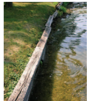
Existing railroad-tie wall

In late August of 2007, near record rain caused flash floods, mudslides and high water all over the Midwest. The seawall failed completely, breaking apart and drifting into the lake. The water on Lake Waubesa was so high that the county suspended all recreational activities on the lake.