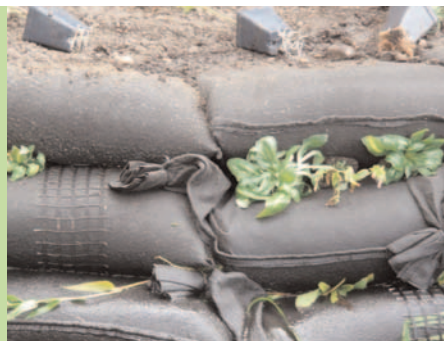
Planting the courses