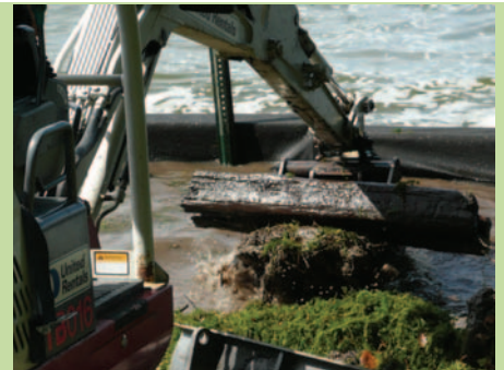
Removing the old wall

The bottom of the lake was excavated to a depth of 6 inches to allow for embedment and the bank was excavated to a 4:1 slope to facilitate the install. This work was done with a rubber tracked mini-excavator.