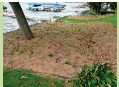
Two weeks after planting